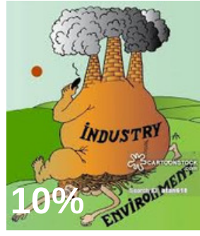
Industry and brick kiln