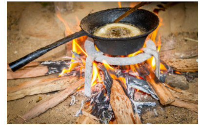
Household cooking and heating