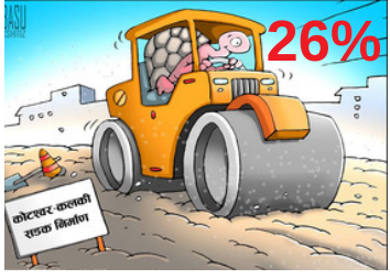
Construction activities (Road + Building)